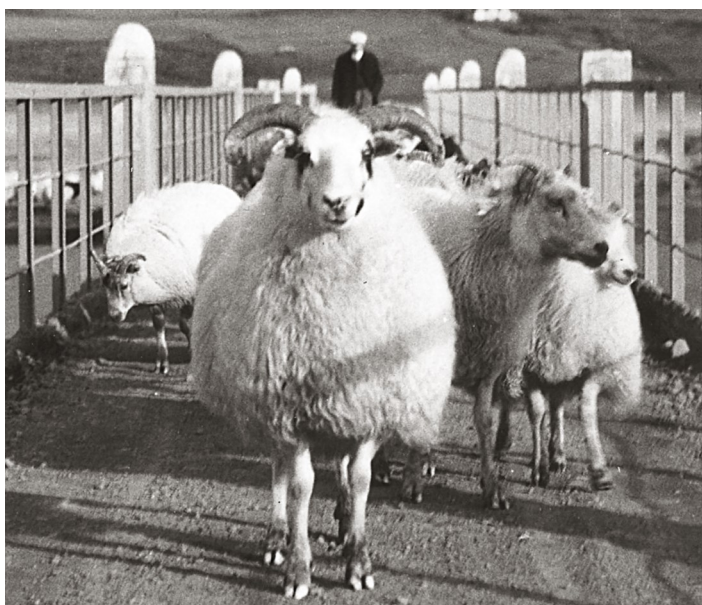
A leaderwether heading a small flock driven across a bridge

Just after the middle of the 20th century when regular Artificial Insemination services were established, leaderrams were included and thus interested breeders could obtain semen from them for AI. In fact several farmers in zones without leadersheep have been initiating leadersheep breeding through upgrading over a number of years with semen from AI-rams, normally two per year, one at each AI-station. Thus AI has proved invaluable in maintaining the small leadersheep population. In recent years these efforts have been strengthened by allowing keen leadersheep breeders to buy live leaders in the autumn from certain isolation zones, both purebred ewe- and ram lambs.