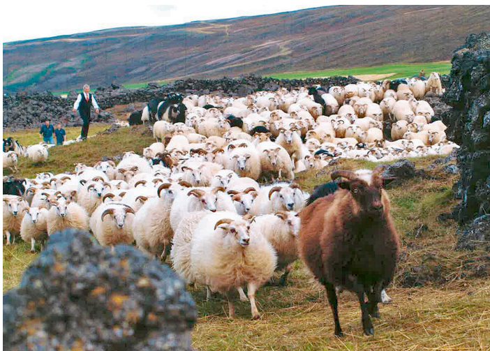
A leaderewe heading a large flock driven into a fold

Looking at leadersheep breeding in more recent times it is important to keep in mind some historical facts in order to understand the development and the situation at present. It seems that in the past these sheep were always unequally distributed within the country, possibly due to local differences in grazing practices in winter. However, during the middle of the 20th century, when the country was divided into several isolation zones and all sheep were killed in large parts of the country under the successful Maedi-Visna and Jaagziekte eradication scheme (see Introduction above), the majority of the leadersheep was lost. Moreover, there was, and still is in most cases, a total ban on the sale of live animals between most of these zones, now mainly because of efforts to eradicate the Scrapie Disease in Iceland. Many of the zones were restocked by sheep from districts in other zones where no leadersheep could be found. The consequences of these massive operations were that nearly all leadersheep now kept in the country, and for some past decades, can be traced back to the Northeast corner of the country.