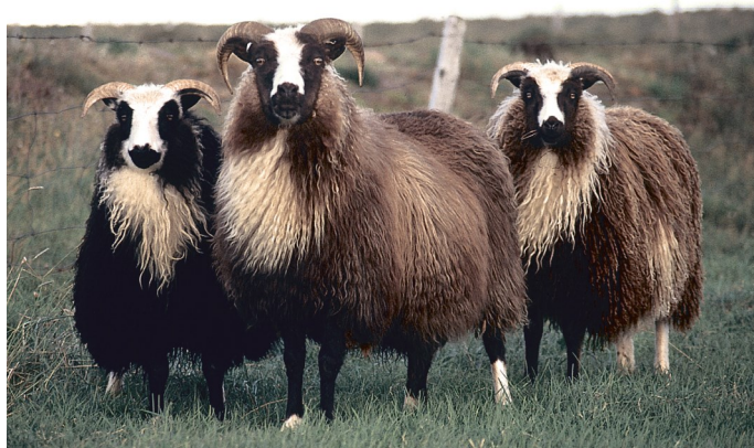
A leaderewe with her ewe lambs

As indicated above little is known about leadersheep breeding centuries ago. It seems that some farmers were actively breeding small populations of these