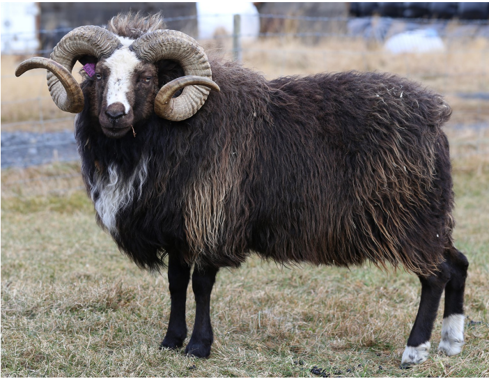
A leaderram (Strumpur 14-815)

unique sheep and that they would often sell and even give them to other farmers. According to Aðalsteinsson (1981b), citing a source from the 13th century, leaders, particularly proven leaderwethers, were normally more highly priced than other sheep due to their wisdom and outstanding behavioural qualities.